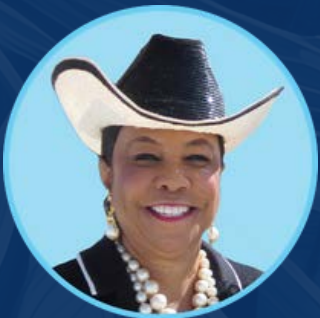
Frederica Wilson U.S. Congresswoman