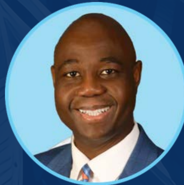
Alix Delsume City of North Miami Mayor