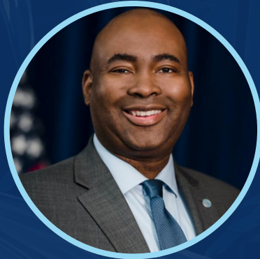
Jaime Harrison Chair of the Democratic Party