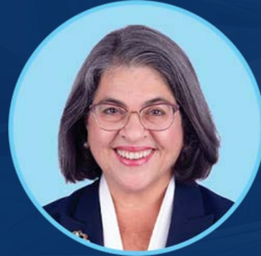
Daniella Levine Cava Miami-Dade County Mayor