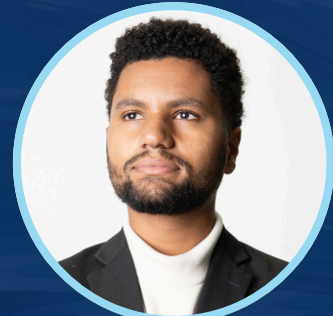
Maxwell Frost U.S. Congressman